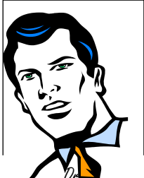
The Principal, L.T.M.M.College, Pune

Date Month Year 0 1 0 6 1 9 7 8 0 0 0 0 0 0 0 0 1 1 1 1 1 1 1 2 2 2 2 2 2 2 2 3 3 3 3 3 3 3 3 4 4 4 4 4 4 4 4 5 5 5 5 5 5 5 5 6 6 6 6 6 6 6 6 7 7 7 7 7 7 7 7 8 8 8 8 8 8 8 8 9 9 9 9 9 9 9