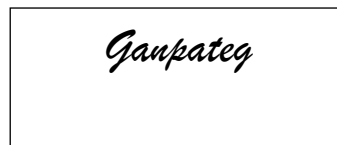
Signature of the Candidate in running hand, within the box only