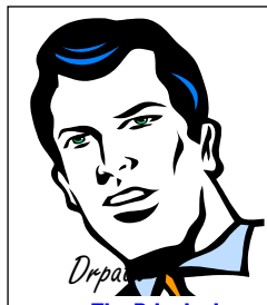
The Principal, L.T.M.M. College, Pune

Date Month Year 0 1 0 6 1 9 7 8 0 0 0 0 0 0 0 0 1 1 1 1 1 1 1 1 2 2 2 2 2 2 2 2 3 3 3 3 3 3 3 3 4 4 4 4 4 4 4 5 5 5 5 5 5 5 6 6 6 6 6 6 6 7 7 7 7 7 7 7 8 8 8 8 8 8 8 9 9 9 9 9 9 9